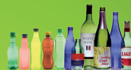
Glass and plastic bottles