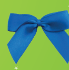
Ribbon and string