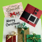
Glittery cards and foil based/ glittery wrapping paper